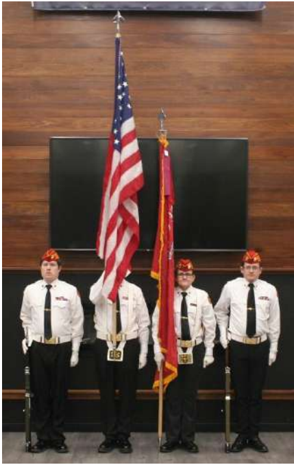
a. Preparatory Command “Present”!