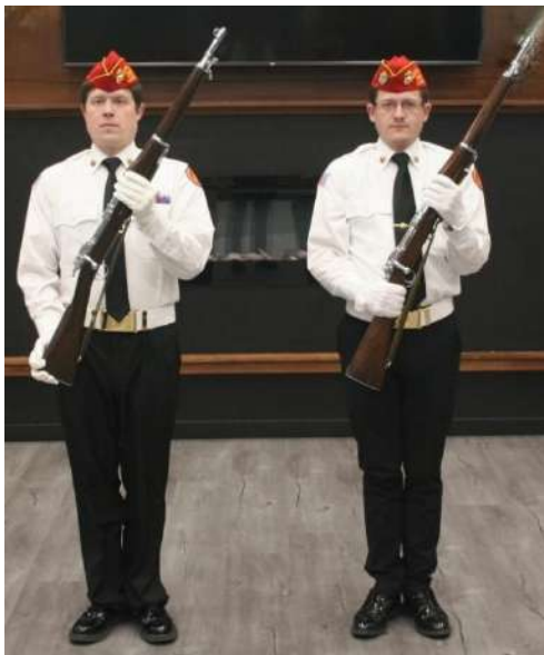
c. Count Two. Both Rifles Moved from the Shoulder.