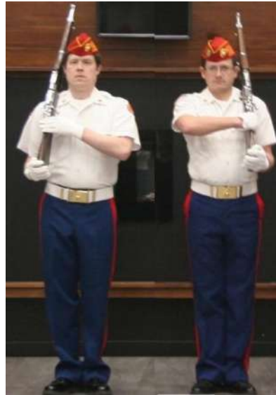
d. Count Three. Both Rifles Moved to the Shoulder.