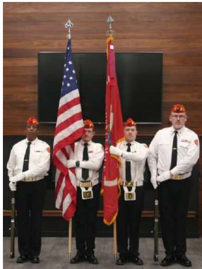
b. Lowering the Staff