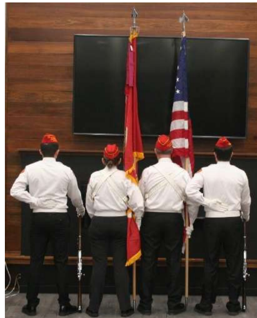
b. Back View

c. Modified position of Parade Rest. The rifle bears, move to place rifle across the body in front and with both hands gripping the barrel, Left hand over Right Hand.