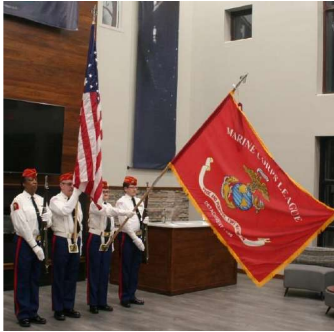
b. Command of Execution “Colors”!