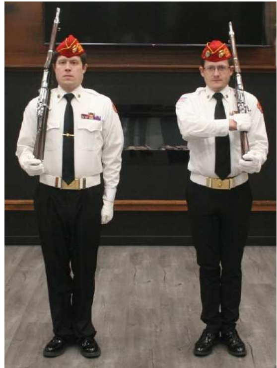
b. Count One. Right Rifle Stands Fast. Left Rifle, Re-grasps the Small of the Stock