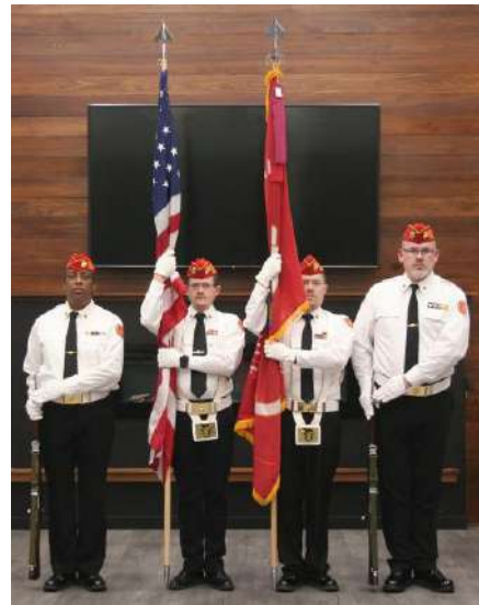
c. Trimming the Colors