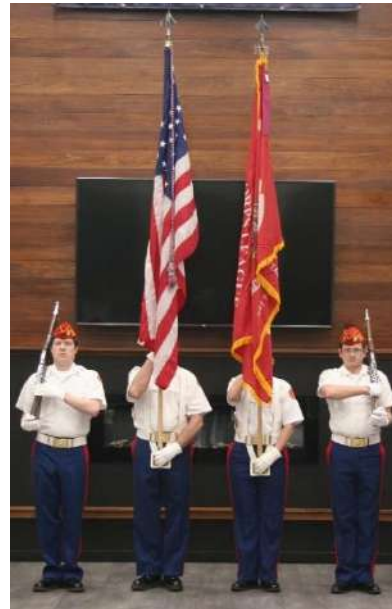
b. Last Count