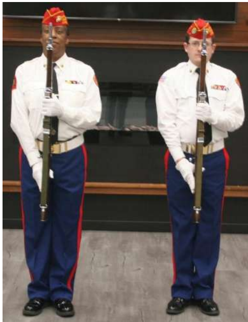
e. Both Rifles Rotated to Present Arms.

7030. PRESENT COLORS TO CARRY COLORS. The command may be “ Carry, COLORS ” or “ Shoulder, ARMS. ” This is a three-count movement for the left rifleman and a four-count movement for the right rifleman to return the weapons to the left and right shoulder from present arms (Ref (a), Encl 1, Ch. 7, par 6.a.6).