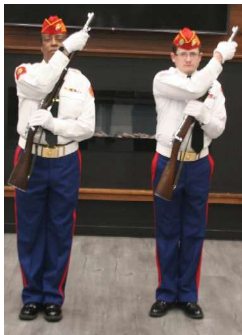
d. Count Three. Both Rifles Riflemen Re-grasp, the Barrel.