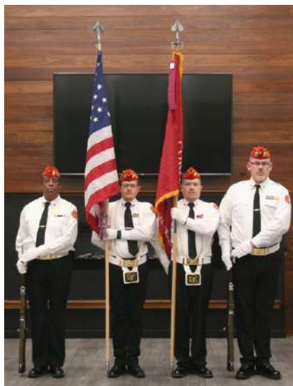
d. All Movement Halted