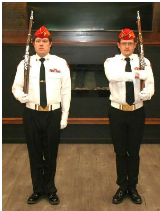
b. Count One. Both Rifles Rotated to Port Arms.