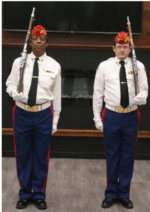
e. Count Four. Ready Cut.