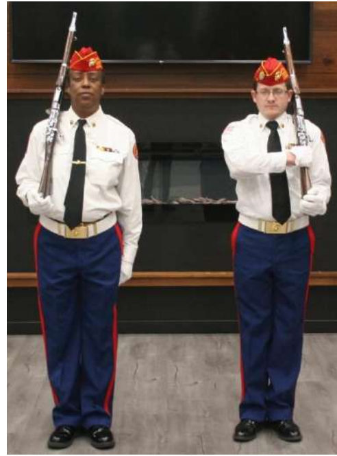
b. Count One. Right Rifle Stands Fast. Left Rifle, Re-grasps the Small of the Stock.