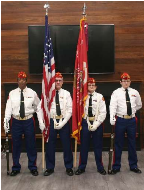
a. Front View

b. At the command “ Parade, REST; ” “ AT EASE; ” or “ REST, ” all members of the color guard execute parade rest. The color staff will remain along the color bearer’s side and will not be thrust forward as with a guidon staff. The national and organizational colors bearers will grasp the sling socket with their left hand.