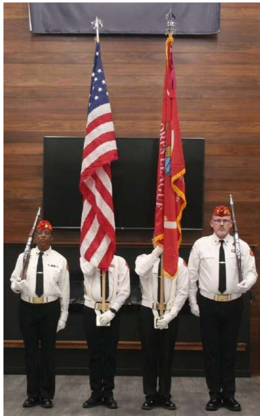
a. Removing the Ferrule

e. Color guard armed with rifles will execute order arms from right and left shoulder as described in paragraph 3000. All members of the color guard will halt their movements before executing the last count. The senior color bearer will then command “Ready, CUT,” at which time all members of the color guard will return their left hands smartly to their sides and color guard will assume order arms.