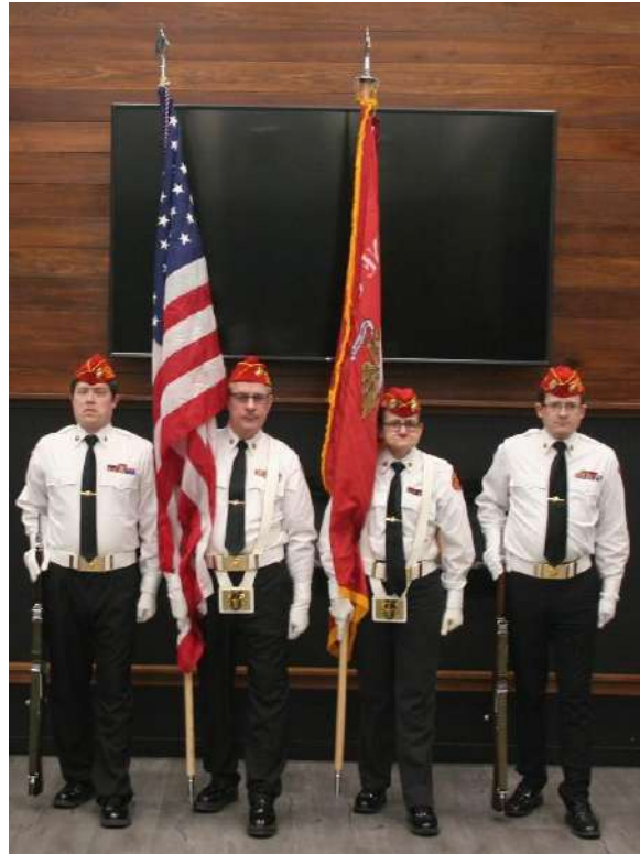
Marching at Trail Colors

e. When the command to halt is given, the color bearers return the colors to the order and move the left arm back to the left side. The Color guard armed with rifles return to the order.