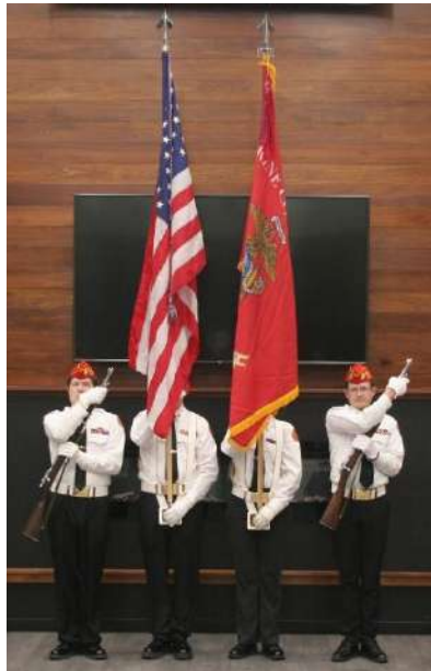
a. Raising Staff

e. All members of the color guard will halt their movements before executing the last count. On the senior color bearer’s command “ Ready, CUT, ” all members will move their free hands smartly to their sides. If the color staffs need additional support due to high winds, the color bearers will grip the staff with their left hands just below their right.