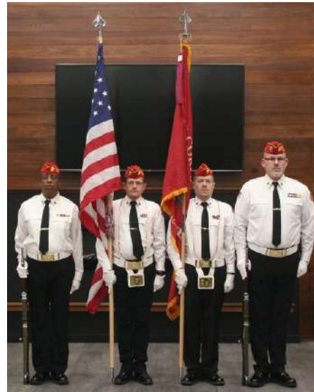
e. Movement Complete