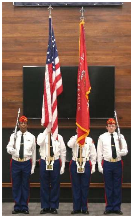
c. Carry Colors