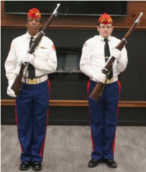
c. Count Two. Right Rifle Grasps the Butt of the Rifle. Left Rifle, Stands Fast.